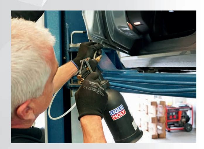
LIQUI MOLY GmbH Jerg-Wieland-Straße 4 89081 Ulm GERMANY

Phone: +49 731 1420-0 Fax: +49 731 1420-75 E-Mail: info@liqui-moly.com www.liqui-moly.com